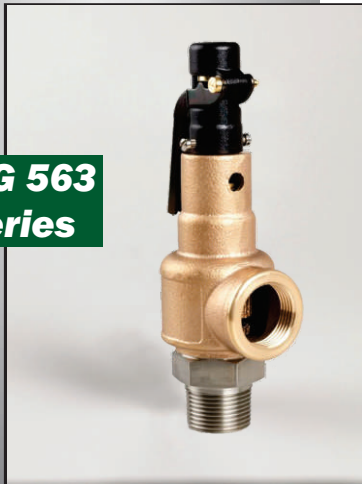
KNG 563 Series