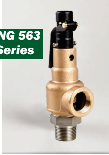
KNG 563 Series