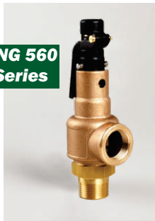
KNG 560 Series