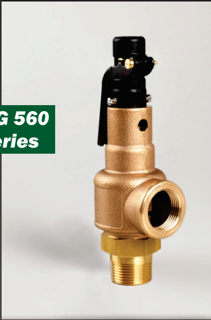
KNG 560 Series

The KNG 560/570 Series valve line is a high capacity safety valve used for boilers, piping lines and vessel protection. Designed and engineered for heavy-duty industrial use. ASME approved and National Board flow-rated for capacity.