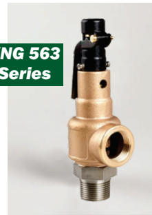
KNG 563 Series