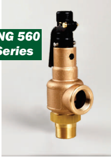
KNG 560 Series